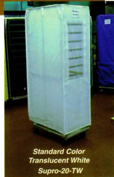
Standard Color Translucent White Supro-20-TW