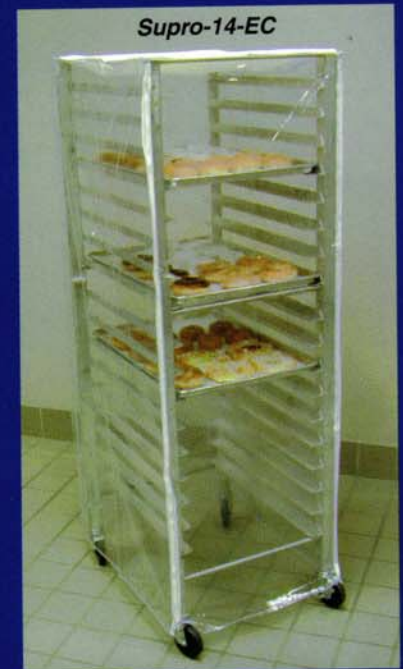
Cold Crack -15°F (ASTM-D 1790)

This photo shows a close-up of the Protecto-Cover® corner that is triple reinforced to prevent wear from rack corners. A labeling pocket and side window are included on every standard cover.