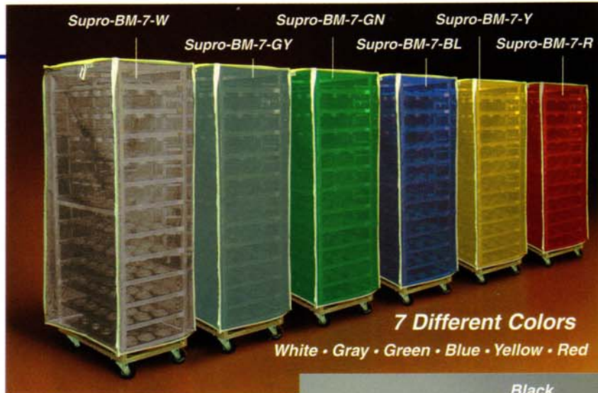
7 Different Colors

White • Gray • Green • Blue • Yellow • Red