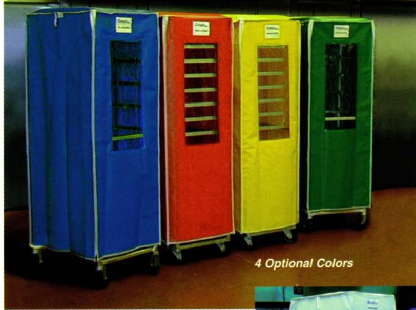
4 Optional Colors